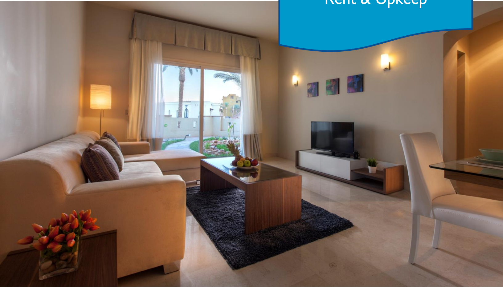
Property Maintenance & Upkeep